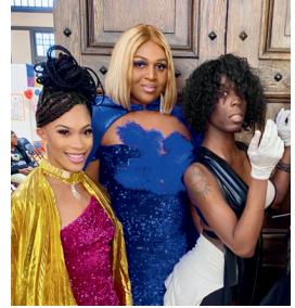
HAUS OF GABBANA